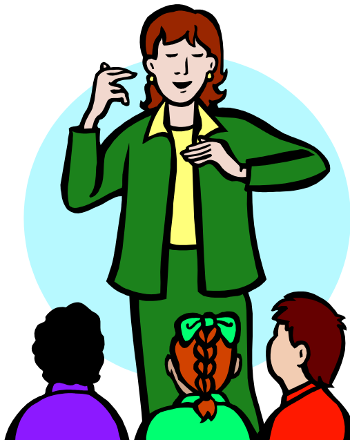
Appendix B: The No Blame Approach

As arranged, the teacher meets with each of the students a week later to review solutions. It is best to check in with the target first. The teacher ascertains whether the bullying has stopped. If so, each student is complimented and thanked. Reviews can be continued for as long as required. Usually two reviews are adequate.