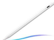
Smart Stylus (Multiple Brands)